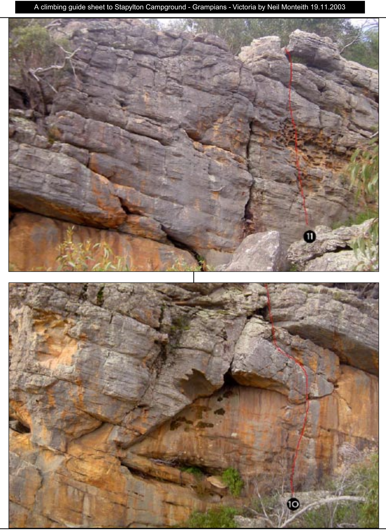
Updates and other online guides can be found at - http://www.neilshaulbag.com